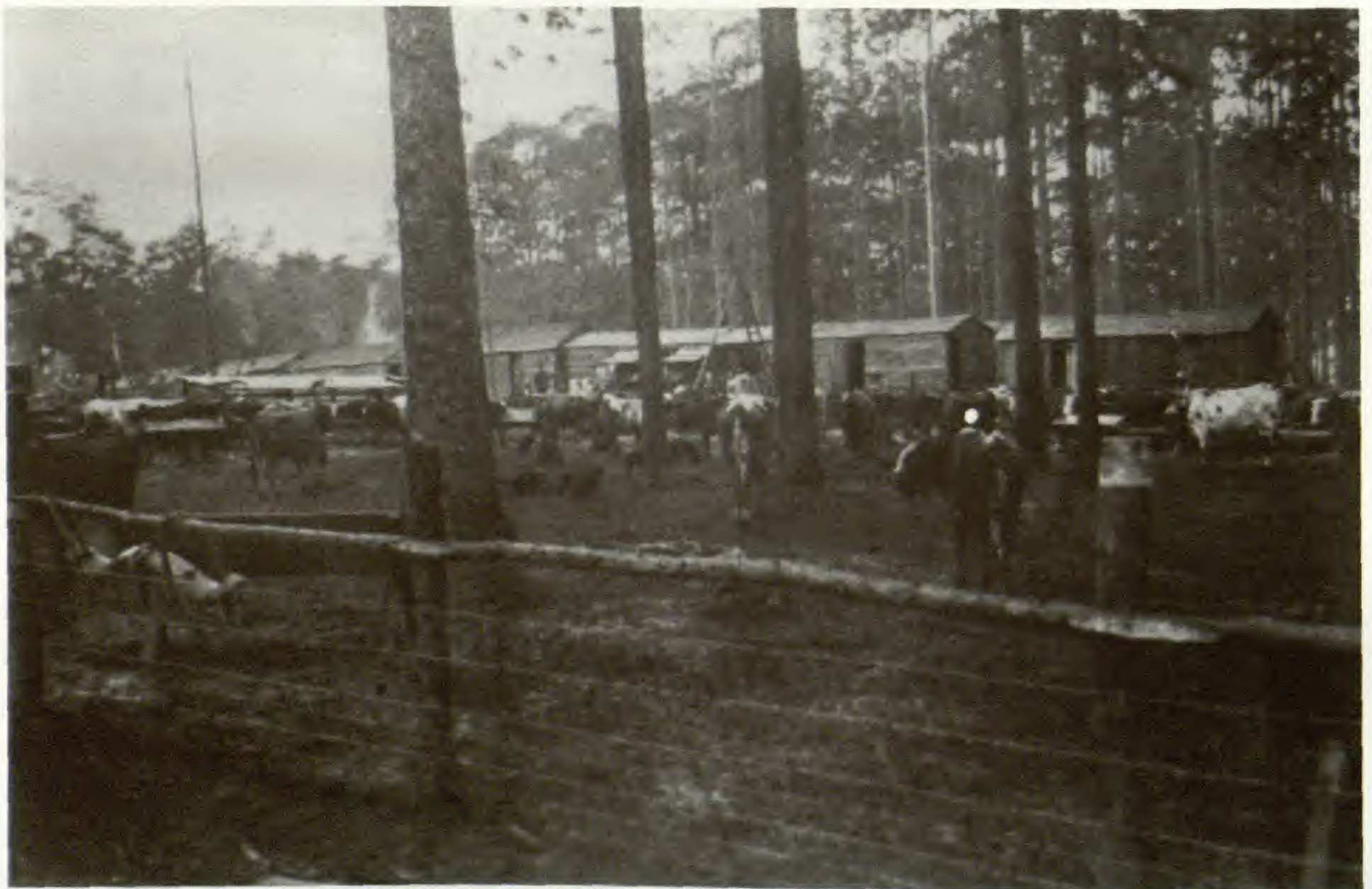
FIGURE 5.—Photograph taken in a west Florida longleaf forest shows a boxcar logging camp similar to those described for Hickey Creek circa 1932-1935 and 1940-1944 (mules were used at Hickey's Creek instead of oxen).